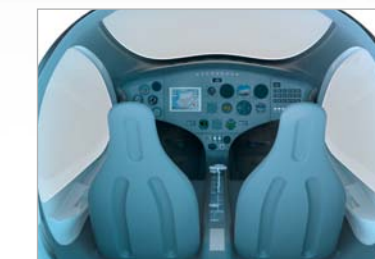
A new dimension: the Cavalon offers a huge interior.