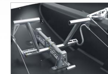
Individually adjustable: pedals can easily be adapted to the pilot's size.