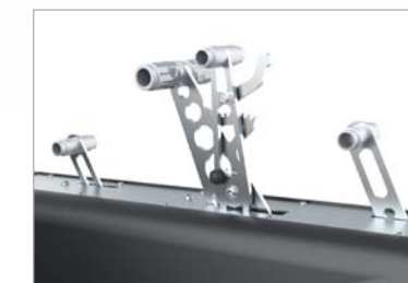
Always at hand: the throttle/brake unit in the center control stand.